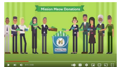
Short Mission Meow overview video available on YouTube